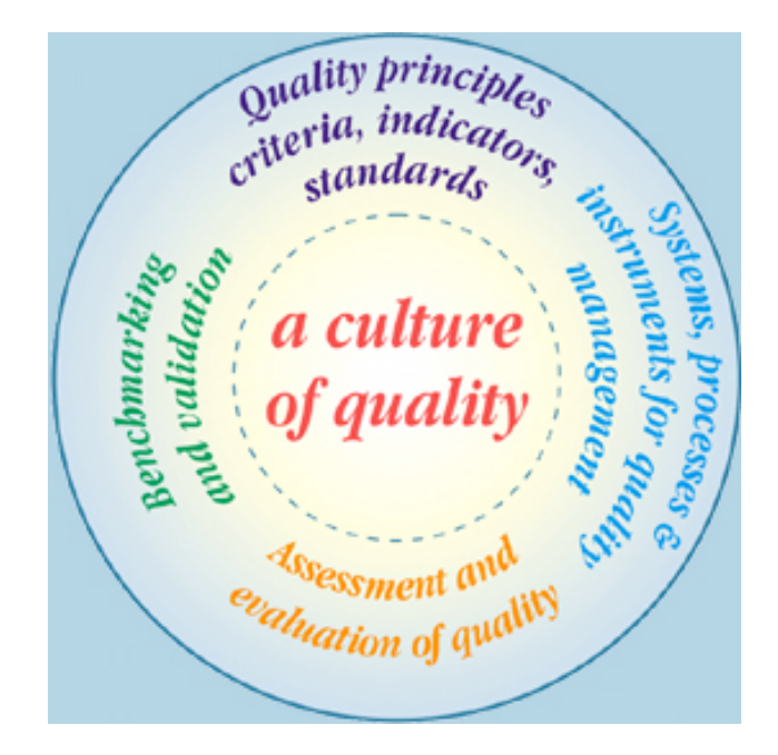
Figure 2: The QualiTraining "quality circle" on the project web site

The overall aim of these projects has been to familiarise language professionals with the quality assurance dimension of education and to contribute to consolidating a quality assurance culture in language education across Europe and beyond, through producing a range of resources - book, CD ROMs, web resources [1, 8, 9] - and providing training for trainers and multipliers.